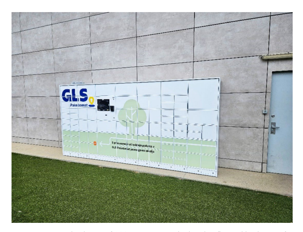
Route optimization and reduction of CO2 emissions are also largely influenced by the use of Parcel Lockers. On average, we save as much as 16 km when visiting 1 Parcel Locker (11 parcels are delivered to one Parcel Locker location on average).

At the Energetics Days 2024, we received a special award in category Energy Efficiency in Transport and Logistics. With the construction of a wide-ranging network of distribution centers, pick-up points and Parcel Lockers, with the establishment of its own charging stations for e-vehicles, with the construction of solar power plants and the plan to electrify the vehicle fleet, GLS Slovenia is an example of good practice in the field of energy efficiency in transport and logistics.