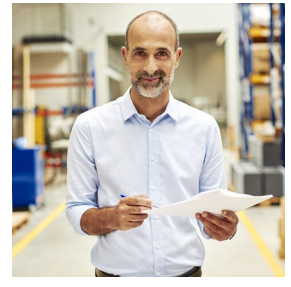
<sup>1</sup> 'GLS Group' and 'GLS' refer to all GLS Group entities, including those entities which do not carry the brand GLS in their names.